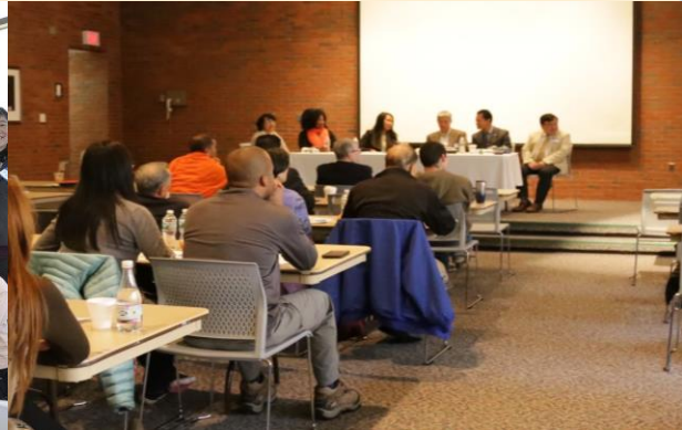
Asian Traditional Medicine in Lowell, November 5, 2016

The AAC's Health and Human Services (HHS) Committee continues its advocacy efforts this year, to raise awareness about AAPI health disparities. The AAC is part of the Asian American Native Hawaiian Pacific Islander (AANHPI) Diabetes coalition, and supports this coalition's efforts to increase awareness about the "diabetes disparity" affecting AAPIs, and is working with various state and national collaborators to try and further publicize the need for heightened screening for diabetes screening at a lower body mass index (BMI) of 23, for AAPIs. The AAC continues its work on advocating on behalf of various behavioral health issues, including depression and suicide prevention, problem addictions (such as compulsive gambling), and other conditions affecting the AAPI community disproportionately (post-traumatic stress disorder in Southeast Asians).