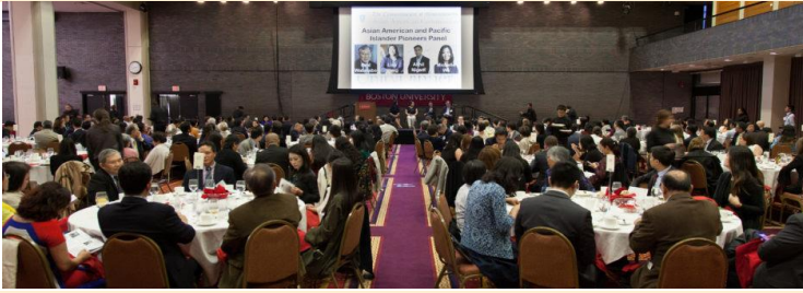
2016 AAC's Unity Dinner at Boston University