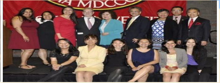
AAC Commissioners and Executive Director

The Unity Dinner serves to celebrate the achievements of Asian Americans & Pacific Islanders (AAPI) around the Commonwealth and to raise the funds to carry out the Commission's advocacy work. Each year's theme explores a trend that heavily influences our economic, political, and social standings.