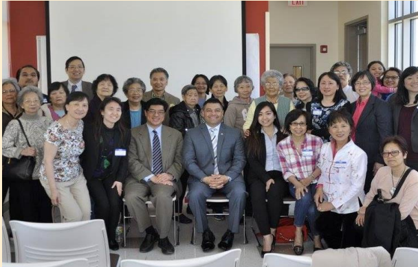
Asian Traditional Medicine in Quincy, April 30, 2016